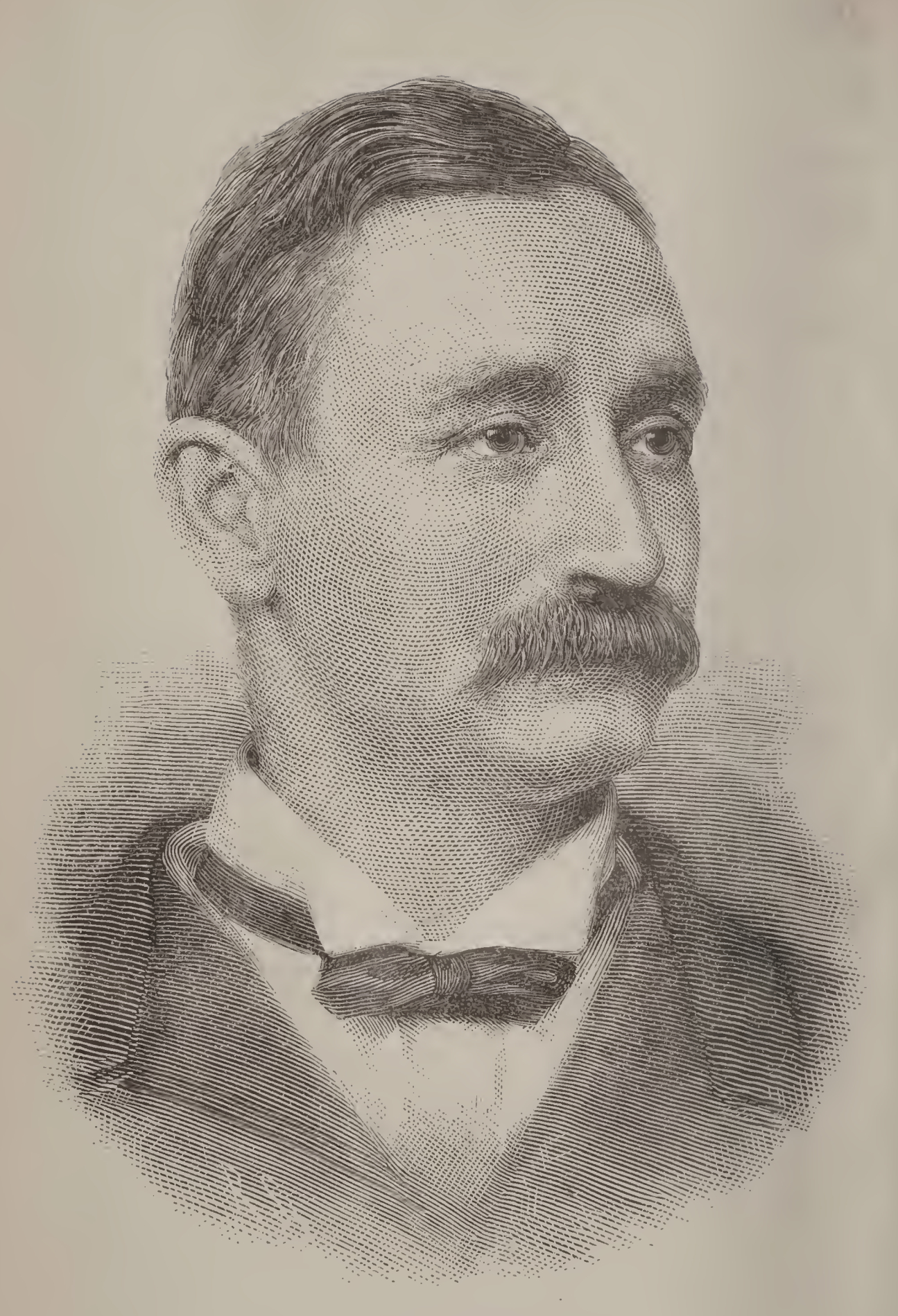
FRED BURNABY.