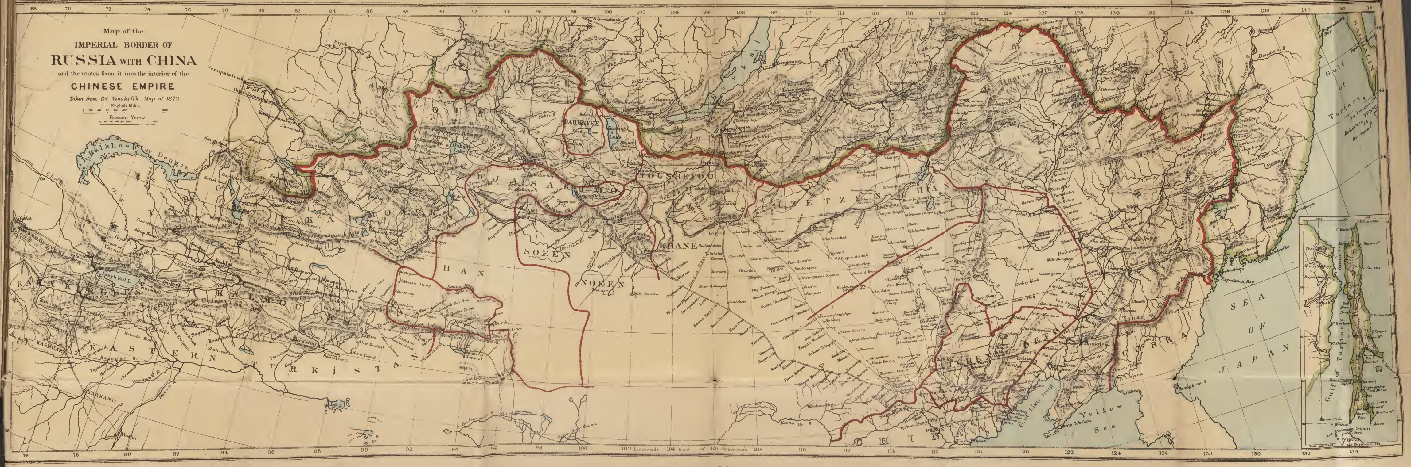
New York, Harper & Brothers.